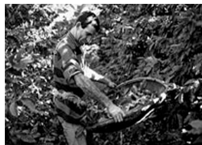
High coffee yields in the shadow of trees

smallholders from the region sell onions, fruit and vegetables on the market and earn double the income.