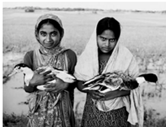
The ducks eat the harmful insects in the paddy-fields, their faeces are used to feed the fishes.

But even as one battle seems to be going well, new storm clouds are gathering on the horizon. Genetic engineering is the new buzzword amongst the seed and chemical corporations - and Asia is being targeted by companies like Syngenta, who are eager to sell patented GM seeds to farmers across the continent. Syngenta has hit upon 'golden rice' as a key promotional too. The new rice is genetically enriched with vitamin A, supposedly as a way to combat malnutrition.