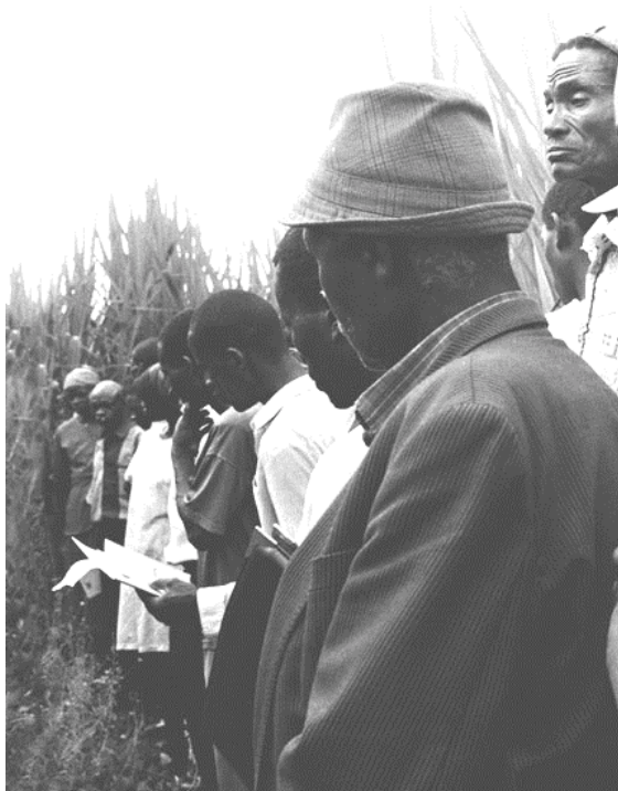
During "field days" farmers teach each other the "push-pull" method.