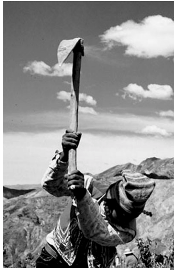
A farmer from Wenqaylla gets potatoes out of the soil.