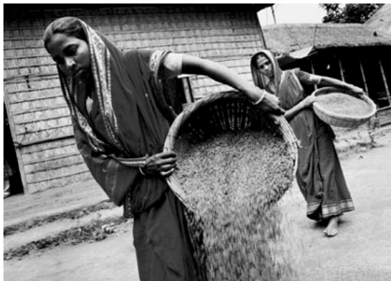
Women are traditionally the ones keeping the seeds.