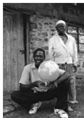
New thinking in Kenya: good maize harvests without pesticides and genetic engineering