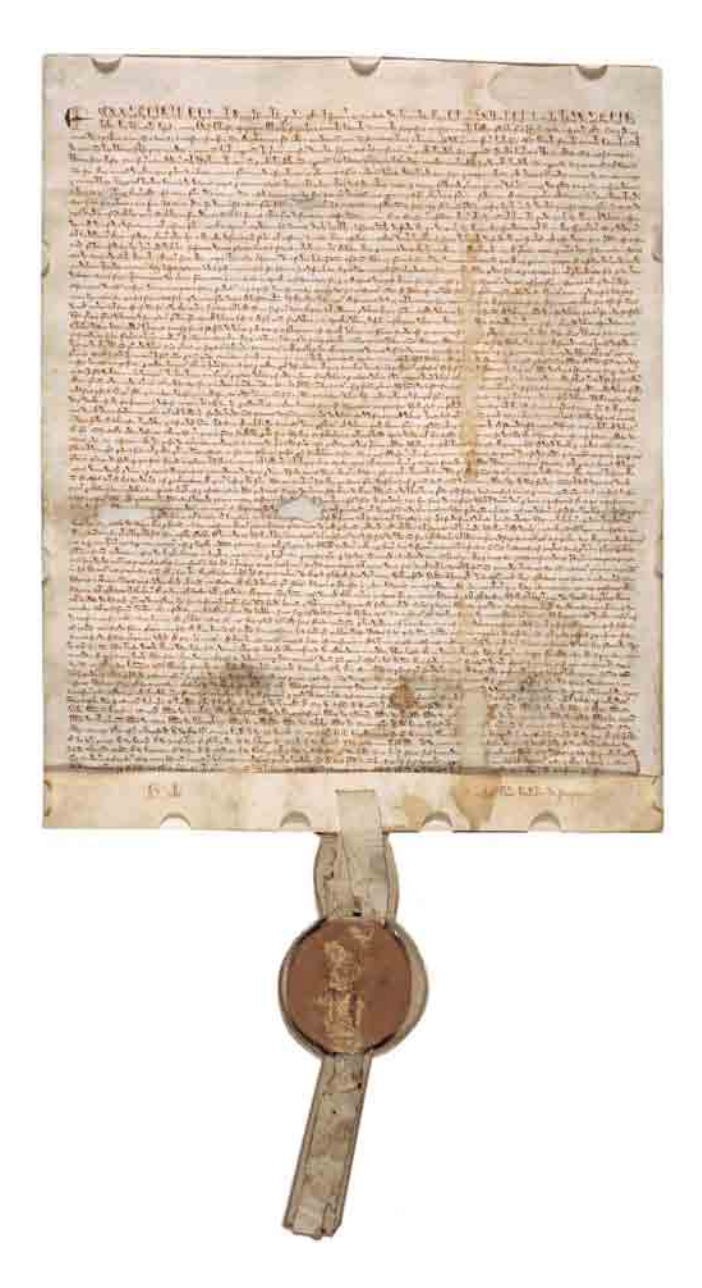
Historical development of English Common Law

E nglish common law emerged from the changing and centralizing powers of the king during the Middle Ages. After the Norman Conquest in 1066, medieval kings began to consolidate power and establish new institutions of royal authority and justice. New forms of legal action established by the crown functioned through a system of writs, or royal orders, each of which provided a specific remedy for a specific wrong. The system of writs became so highly formalized that the laws the courts could apply based on this system