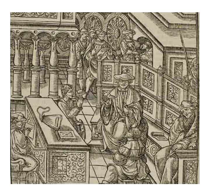
Above: Woodcut of a court scene from Praxis criminis persequendi , Jean Milles de Souvigny, 1541. The Robbins Collection.

The following sections explore the historical roots of these differences.