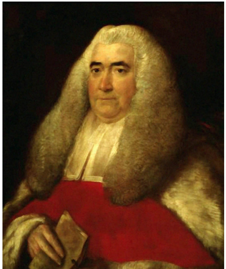
Above: Sir William Blackstone, 1774, by Thomas Gainsborough. Oil on canvas. Tate Collection, London.

And while Blackstone prevails as the principal source for pre-American precedent in the law, it is interesting to note that there is still room for the influence of Roman civil law in American legal tradition. The founding fathers and their contemporaries educated in the law knew not only the work of English jurists such as Blackstone, but also the work of the great civil law jurists and theorists. Thomas Jefferson, for example, owned several editions of Justinian's Institutes , and praised the first American translated edition from 1812, with its notes and annotations on the parallels with English law, for its usefulness to American lawyers. Indeed, a famous example of