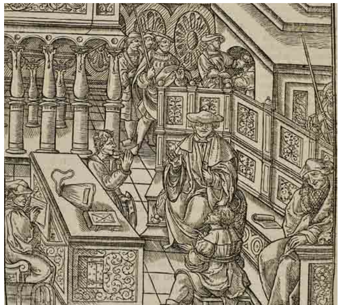
Above: Woodcut of a court scene from Praxis criminis persequendi , Jean Milles de Souvigny, 1541.

The following sections explore the historical roots of these differences.