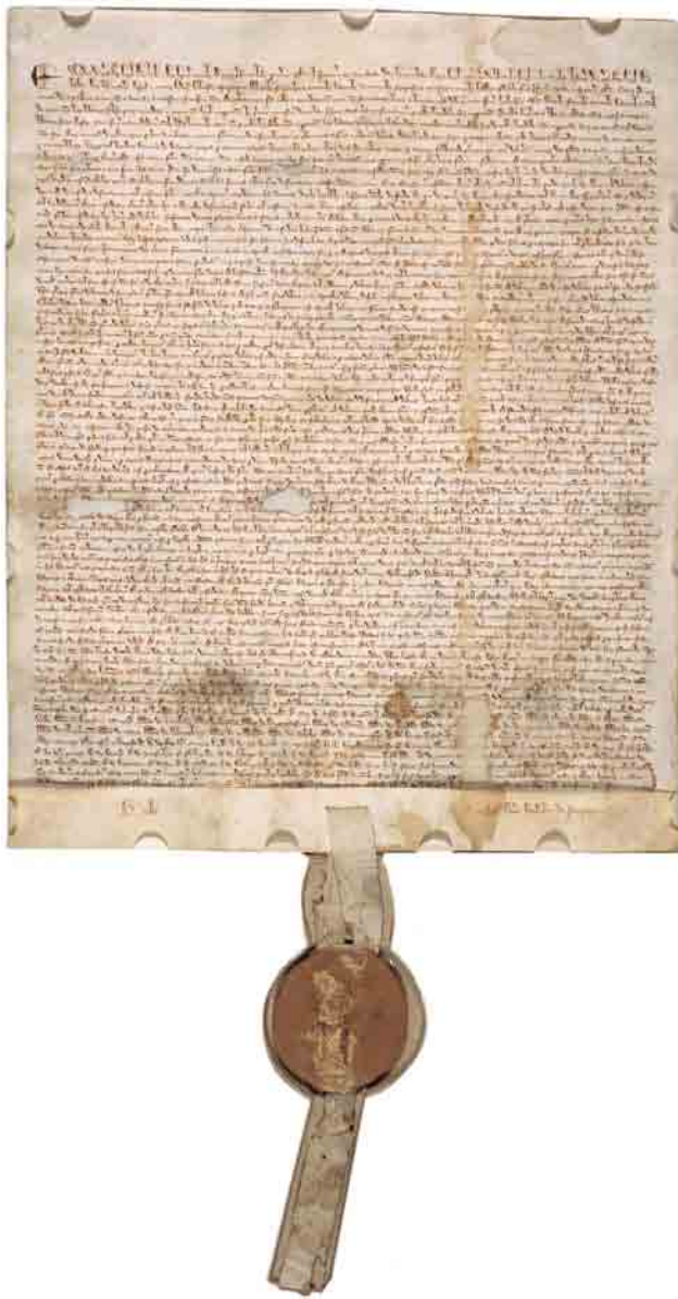
Left: Originally issued in the year 1215, the Magna Carta was first confirmed into law in 1225. This 1297 exemplar, some clauses of which are still statutes in England today, was issued by Edward I. National Archives, Washington, DC.

often were too rigid to adequately achieve justice. In these cases, a further appeal to justice would have to be made directly to the king. This difficulty gave birth to a new kind of court, the court of equity , also known as the court of Chancery because it was the court of the king's chancellor. Courts of equity were authorized to apply principles of equity based on many sources (such as Roman law and natural law) rather than to apply only the common law, to achieve a just outcome.