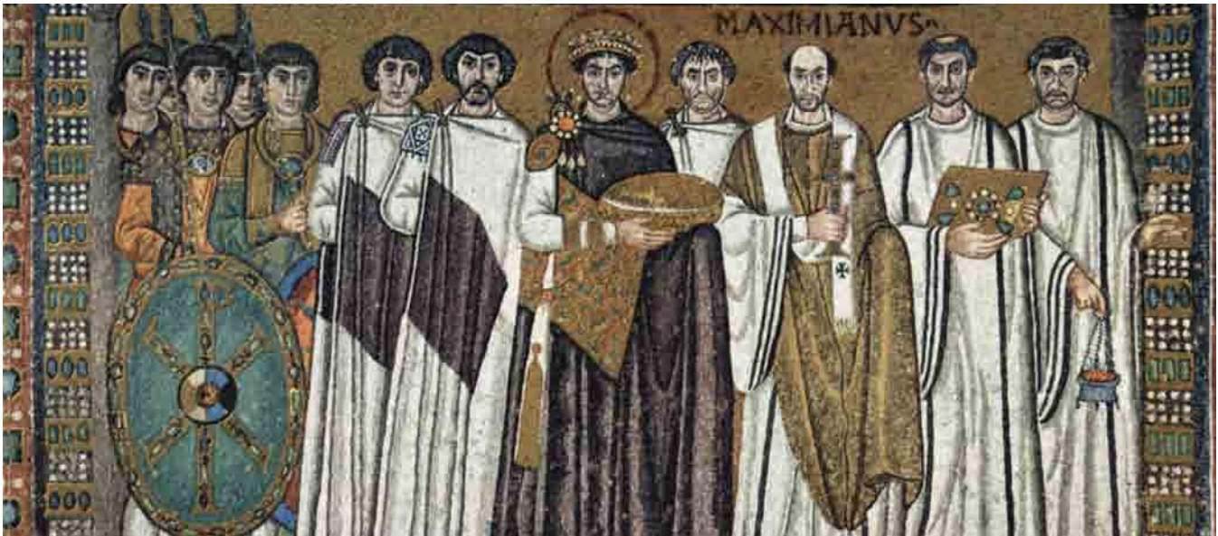
Above: Mosaic of Emperor Justinian I, 6th CE. Basilica of San Vitale, Ravenna, Italy.